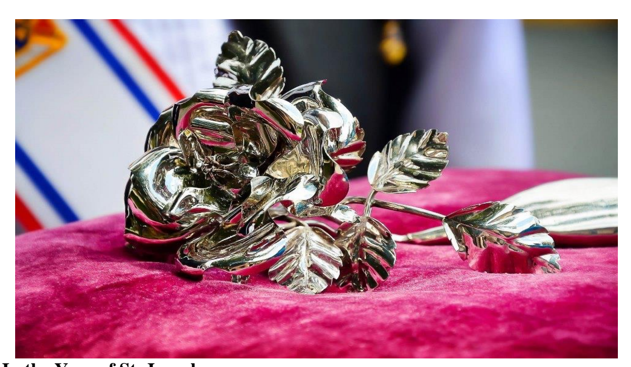
In the Year of St. Joseph ---

Due to COVID guidelines for church limitation on numbers it is suggested that you sign at the site where you wish to attend. This, in case the outdoor venue becomes unavailable.